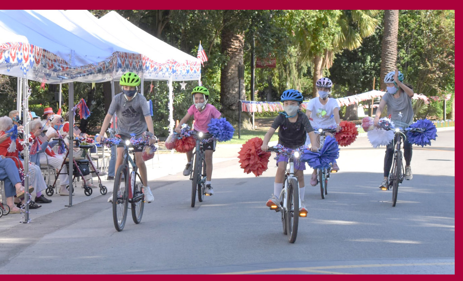
Independence Day in the US! Our sisters at Oakwood Retirement Center in California, enjoyed a fourth of July parade of festive cyclists and decorated cars with loving messages from the Sacred Heart Schools Atherton students and parents.