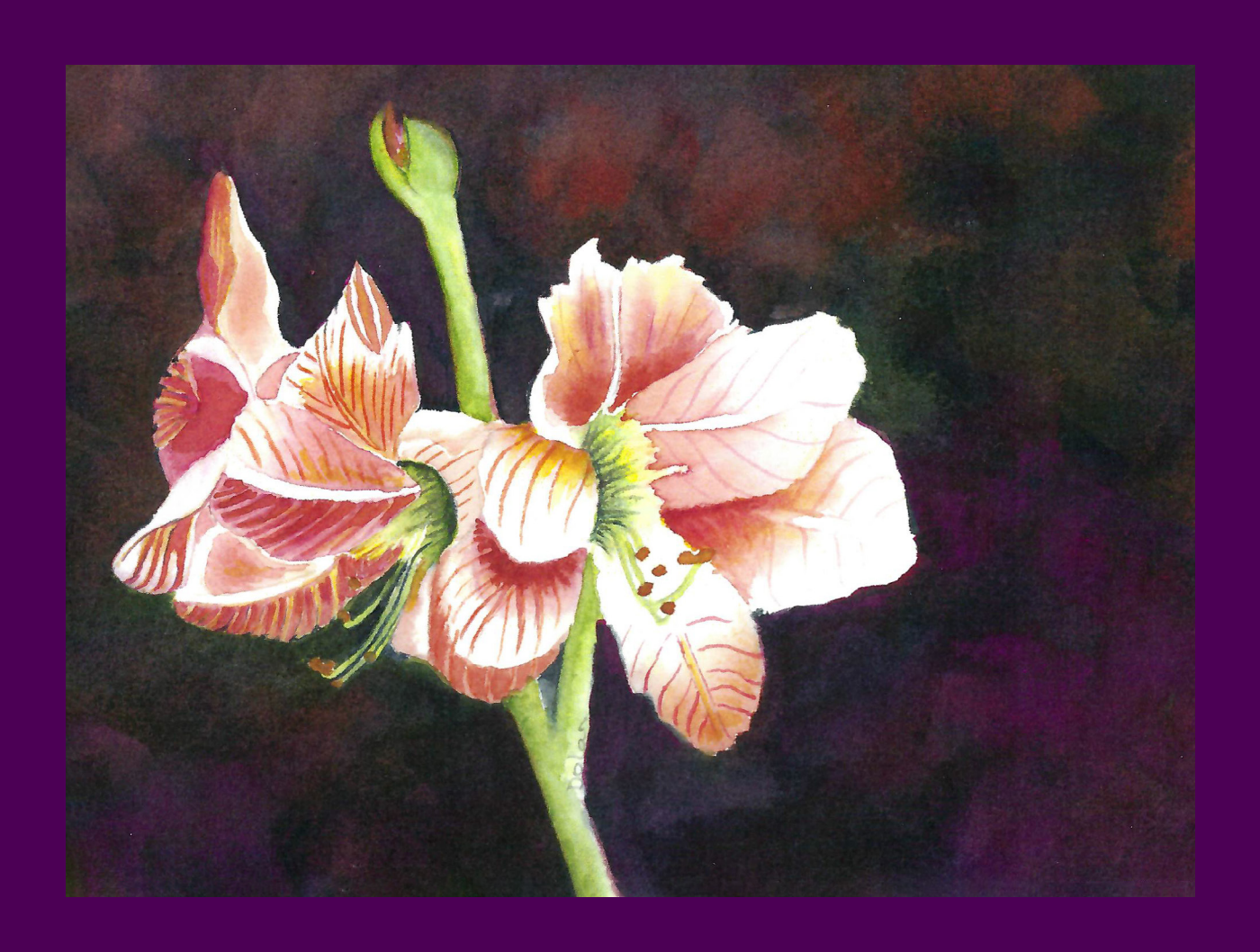
Revealing God's Love in the midst of uncertainty